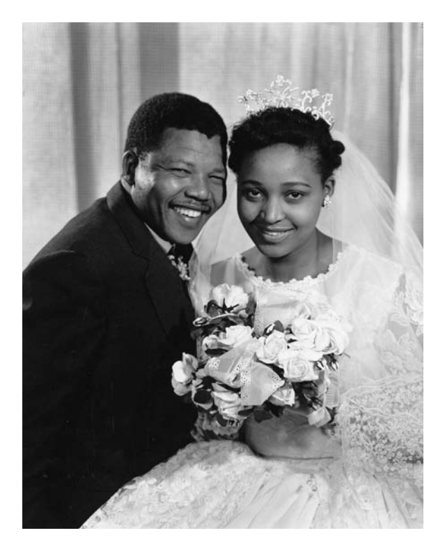
Wedding of Nelson and Winnie Mandela, 1958.