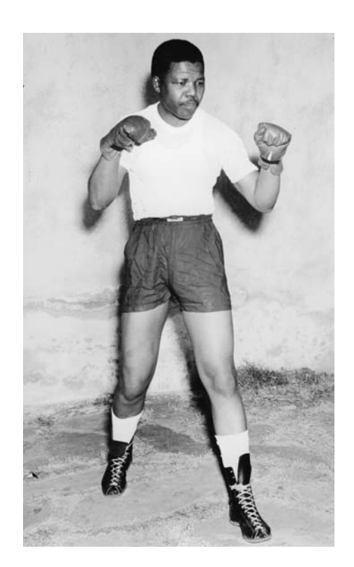
Mandela the boxer, 1950s.