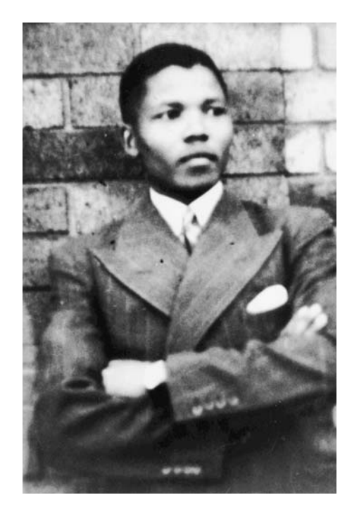
Mandela as a young man.