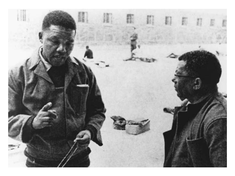
Mandela and Sisulu on Robben Island, 1960s.